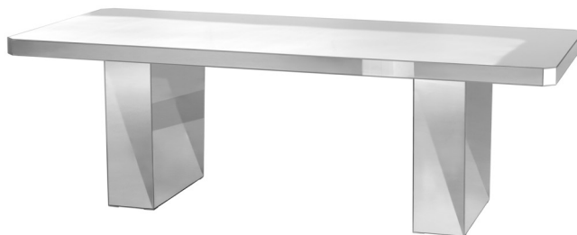
Table constructed in three mirror volumes: two bases and a top. The internal structure is in wood, painted metal grey. Each of the three elements is externally clad in natural mirror. Mirror edges all hand-made with gold detail.