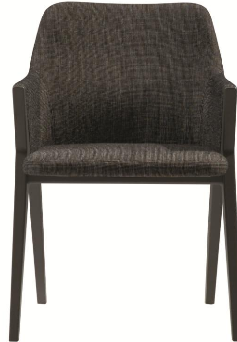
Bridge – Chair with arms –Silla con Brazos